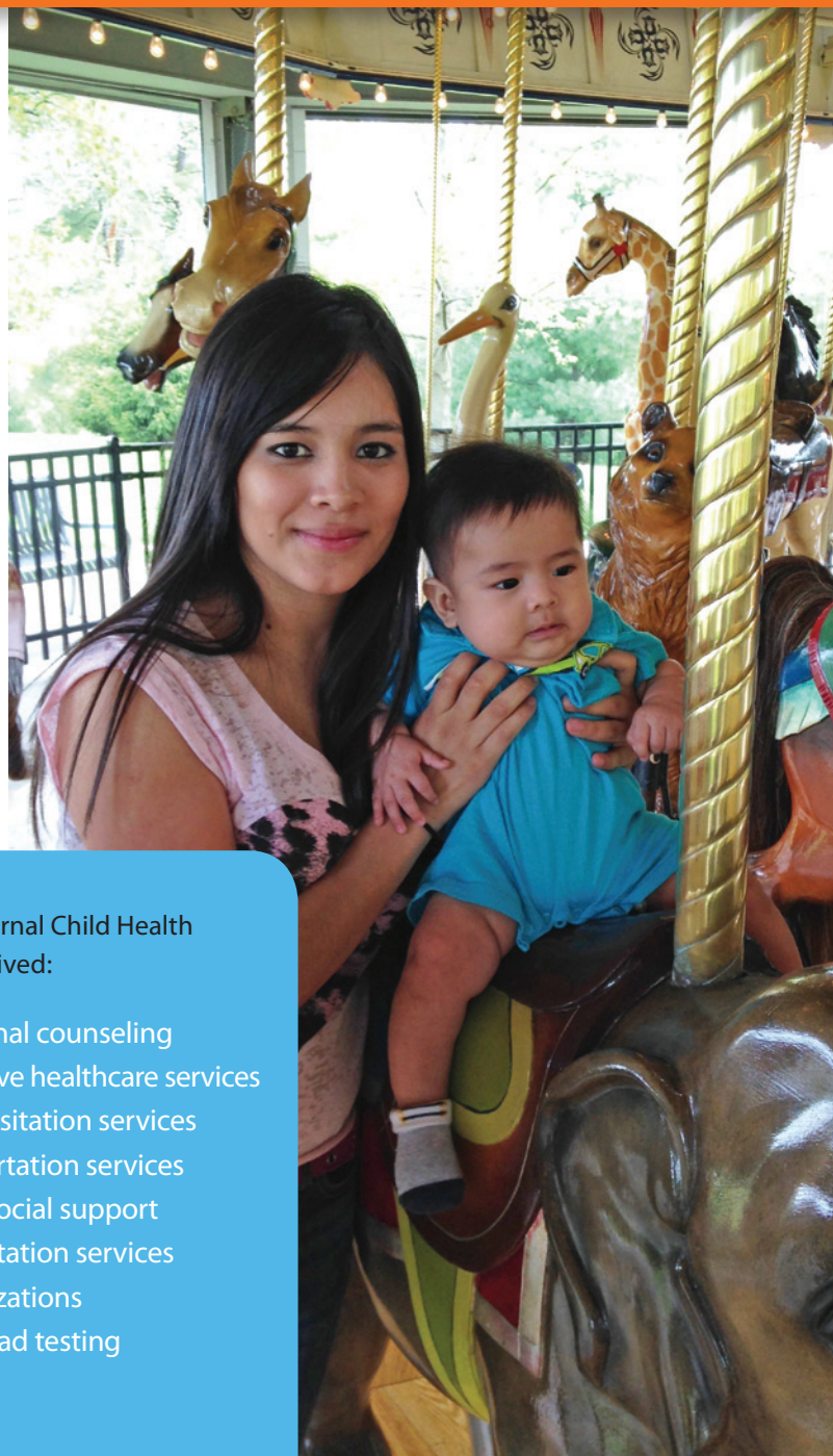
Photo: VNS of Iowa's Nurse Family Partnership program hosted its 4th Annual Mothers in Bloom event in Union Park. The team hosts this special event to celebrate current and past graduate mothers and their families.

21,327 children and 1,167 women were served by the Maternal Child Health programs at VNS of Iowa. These women and children received: