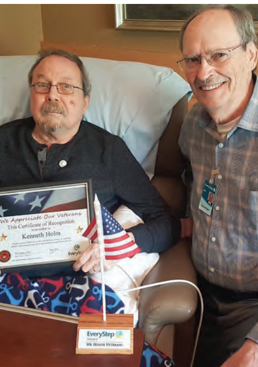
Kavanagh House, Des Moines

Most hospice care happens in people's homes. However, when a patient needs around-the-clock hospice care, including pain and symptom management, EveryStep's Kavanagh House house is available, which provides a home-like atmosphere with private bedrooms, a family room, family café and other amenities.