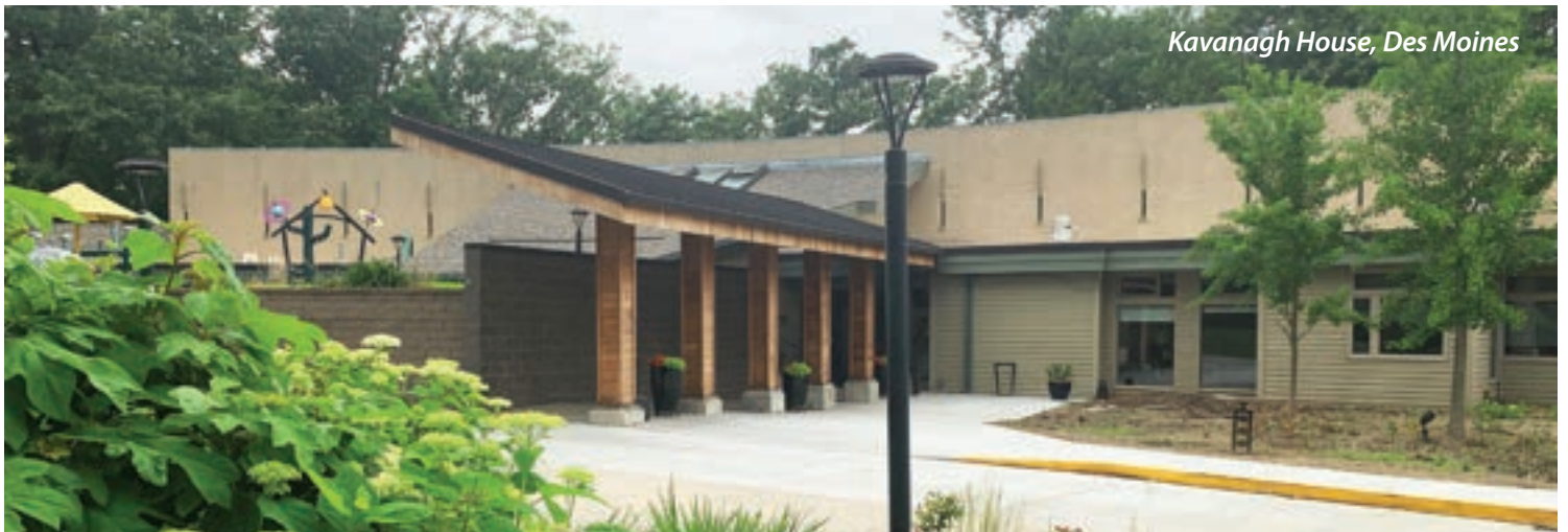
Kavanagh House, Des Moines

For a list of all hospice offices and locations, visit everystep.org/locations .